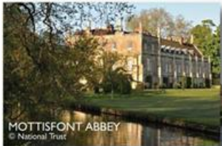
MOTTISFONT ABBEY

WALKERS WILL HAVE BUS TIMINGS CONFIRMED BEFORE EVENT. *For guidance only